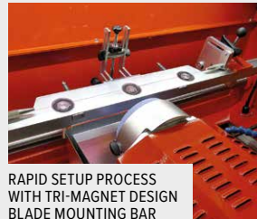
RAPID SETUP PROCESS WITH TRI-MAGNET DESIGN BLADE MOUNTING BAR