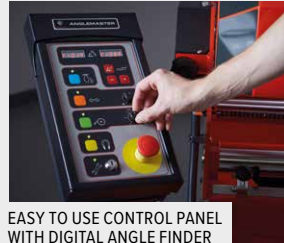
EASY TO USE CONTROL PANEL WITH DIGITAL ANGLE FINDER

The Anglemaster 4100 provides users with increased flexibility and control over grinding practices. This machine is designed to work with both CBN and ceramic stones.