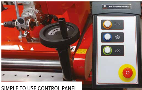
SIMPLE TO USE CONTROL PANEL