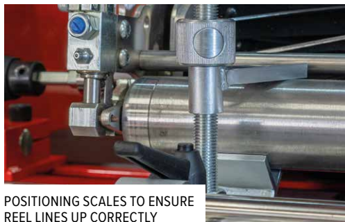
POSITIONING SCALES TO ENSURE REEL LINES UP CORRECTLY