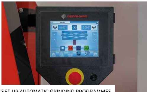
SET UP AUTOMATIC GRINDING PROGRAMMES

AUTOMATED EXPRESS DUAL 4300 PROVIDES SPEED AND EASE OF USE. WITH ADVANCED AUTOMATION IT DELIVERS RAPID, SAFE AND ACCURATE GRINDING.