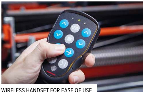
WIRELESS HANDSET FOR EASE OF USE