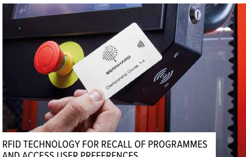
RFID TECHNOLOGY FOR RECALL OF PROGRAMMES AND ACCESS USER PREFERENCES