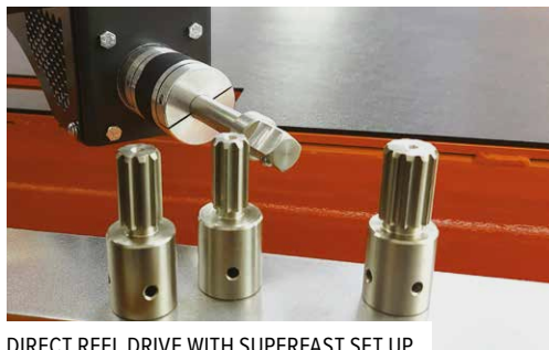
DIRECT REEL DRIVE WITH SUPERFAST SET UP