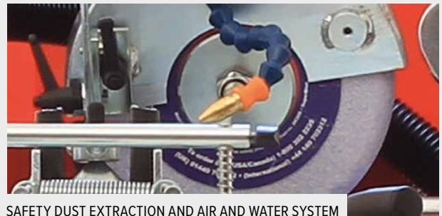
SAFETY DUST EXTRACTION AND AIR AND WATER SYSTEM

With a clamp mechanism and fast-aligning jig bars, blade mounting is quick and easy, improving overall cycle time.