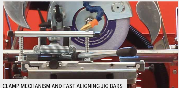
CLAMP MECHANISM AND FAST-ALIGNING JIG BARS